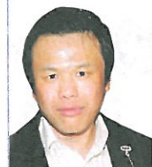
Panelists ZANG TOI Global Entrepreneur

Dato' Sri Mustapa Mohamed has held a number of government positions, including Deputy Finance Minister, Minister for Entrepreneur Development, Minister in the Prime Minister's Department, Minister for Higher Education and Minister for Agriculture and Agro-based Industry. He is an economist and a First Class Honours degree graduate from the University of Melbourne, Australia. He obtained his Masters in Economic Development from Boston University USA.